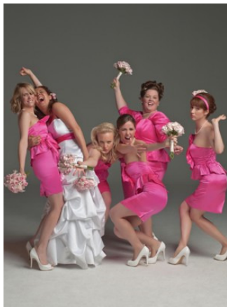
Please, please see this movie.

Bridesmaids is sure to be an instant classic.